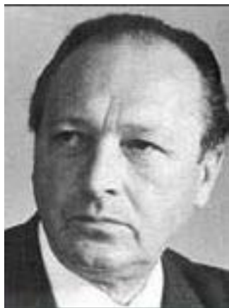
Lyubomir Pipkov ((1904-1974)